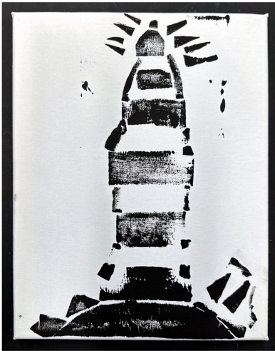
1st Grade Art