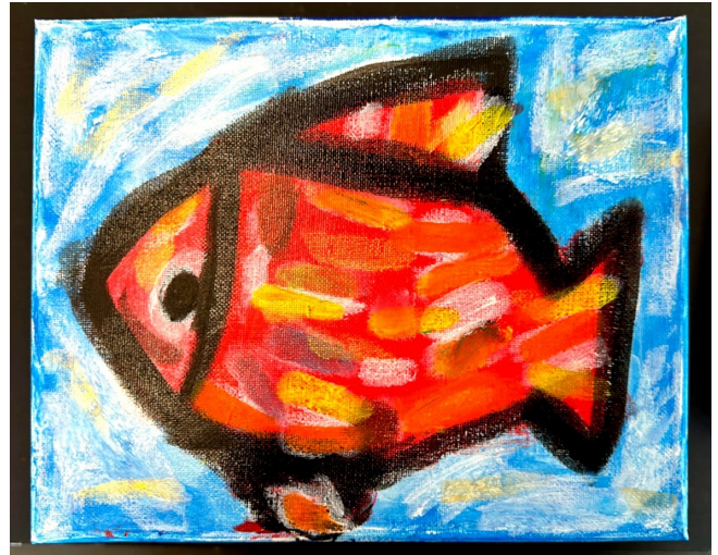
2nd Grade Art