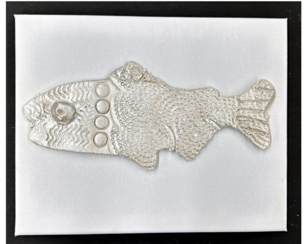
4th Grade Art

Here are the creations from each grade. Find the best addition for your home!