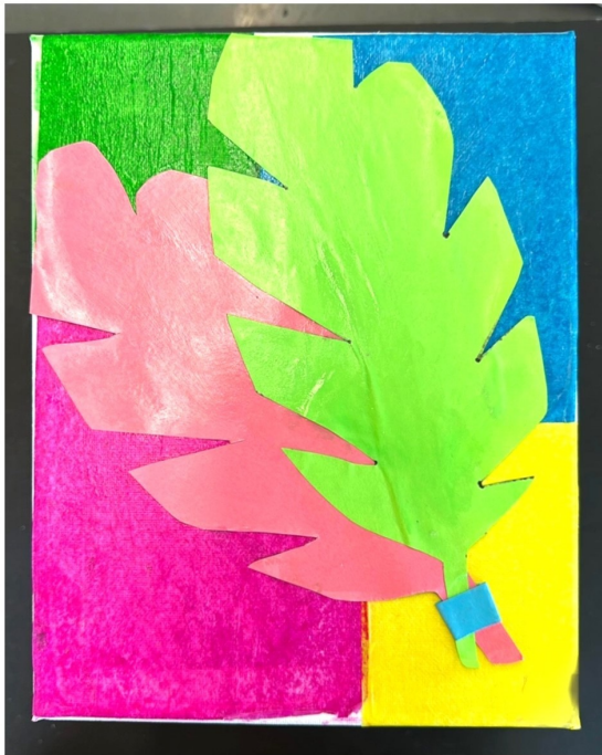
3rd Grade Art