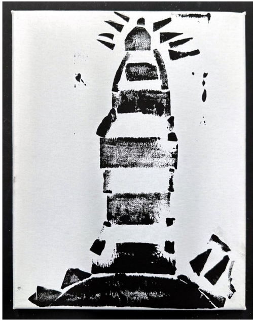
1st Grade Art